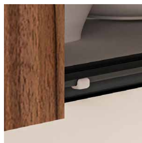
Practical silent rubber bumper clipped into the profile

Its installation through Rincomatic Clip-System avoids additional machining of cabinets